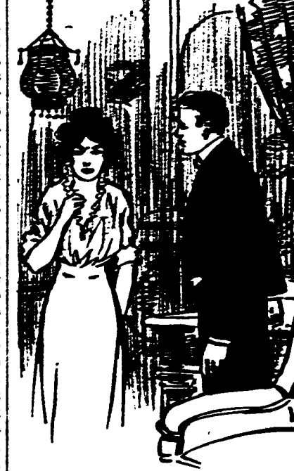
"Ah, it was a Hard Thing to Do!"

FRUIT JAR LABELS. BE FIRST TO BENEFIT BY BUYING READER'S. $100 MONTHLY can be made looking out for yourself. Write to: READER'S, 515 Broadway St., New York, N. Y.