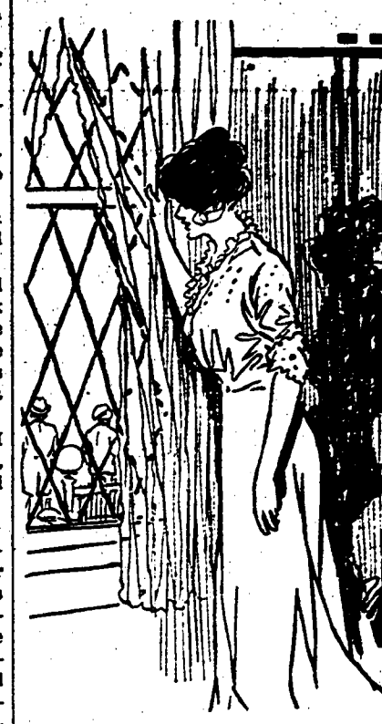
She Watched Until Both Were Out of Sight.